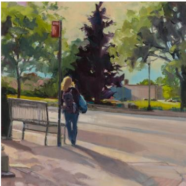
"INTERLUDE"-Oil on Canvas-10" x 10"-Sina March

Sina March will have 4 paintings in this show.