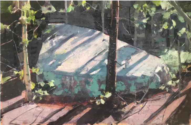
Painting in Progress- Acrylic Encaustic- Kevin Weckbach

Kevin Weckbach will be demonstrating Acrylic Encaustic at our Zoom meeting on September 8, 2020. Acrylic Encaustic is a new water-based paint product. Encaustic is a painting technique using hot wax. However, although there is wax in this paint, it does not require heat to be used.