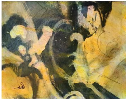
River Rocks - Mustard