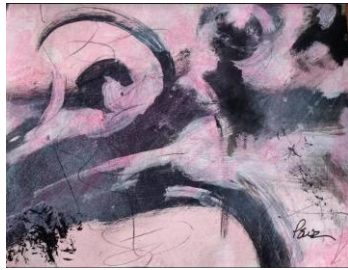
River Rocks - Pink