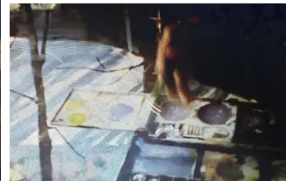
Ceracolor Water-borne Wax Paint and Palette