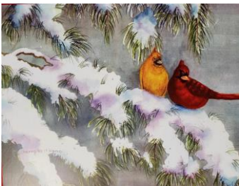
Cardinal in Winter

Sherry Veltkamp – ACC Gallery Virtual Exhibition Nov 1-30, 2020