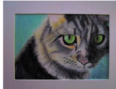
Vicki Metz - Staring Contest - Colored Pencil

Vicki's other pieces entered in the Mountainside Art Guild Miniature Show