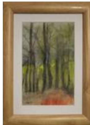
Caribou Ranch - Watercolor