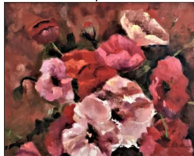
“Big Red Bouquet”